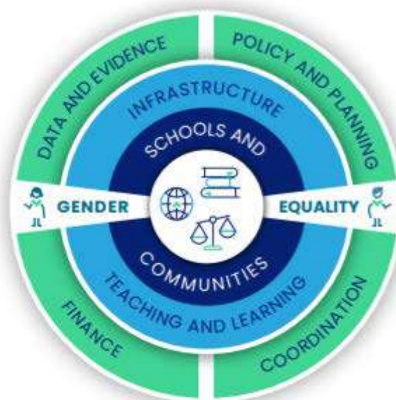
Climate-smart education systems seven dimensions